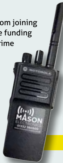
STOREWATCH RADIO DEMONSTRATION

There are a small number of radios available and the scheme enables businesses to report issues, and to keep in contact with one another, the Rangers and other partners, thereby helping to make the area safe and inviting for all to enjoy.