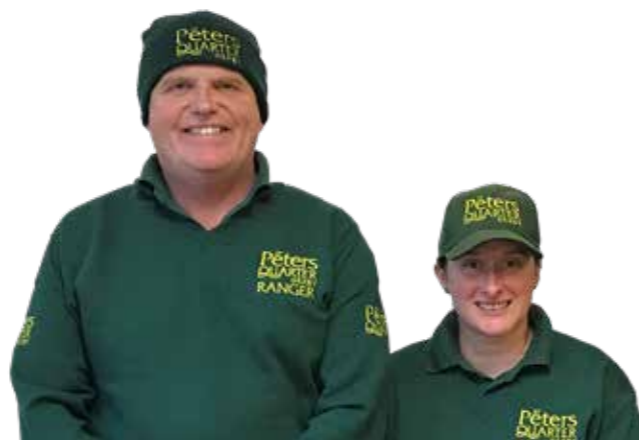
Image taken before COVID-19 social distancing measures